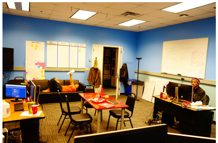
Nice, cozy project room