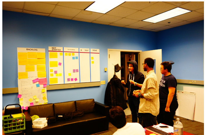
Let's do scrum!

The team wanted to get a working project for the programmers this week as well. We set up a repository and did a "goldspike" (a test project) on the iPad. We had Unity working on the iPad so the technology was now confirmed. This was another week full of preparation, testing, and research. We are excited to be able to start some actual work next week.