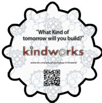
Gear design 1