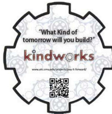
Gear design 2

*1. Please see the shape example above, and click one you like more.