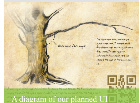
A diagram of our planned UI layout.

For more info visit: http://www.etc.cmu.edu/projects/seecquel