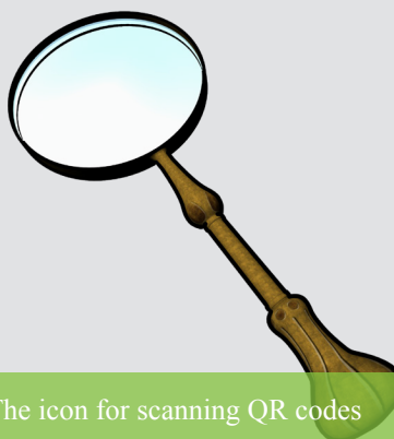
The icon for scanning QR codes