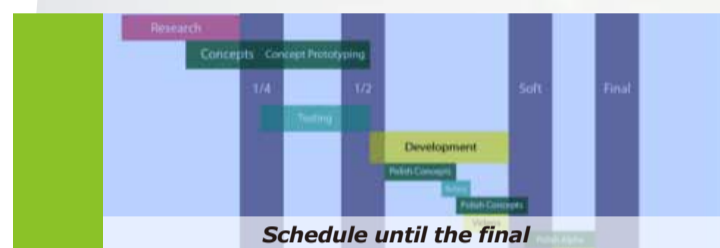
Schedule until the final