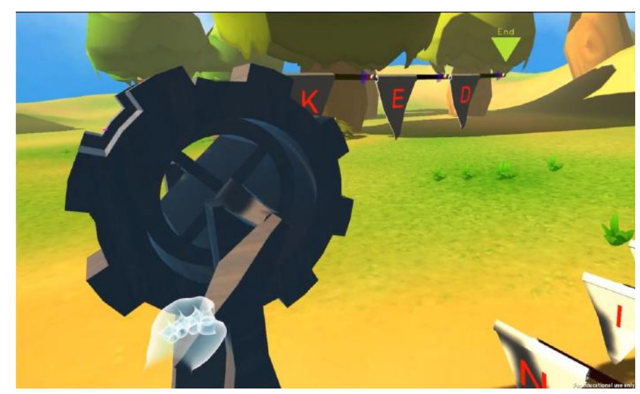
Part 0. Getting familiar with controls

(Make sure that you see the banner's movement before and after releasing the hand.)