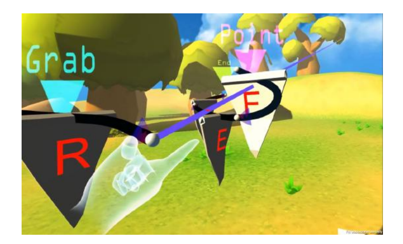
Part 3. Advanced