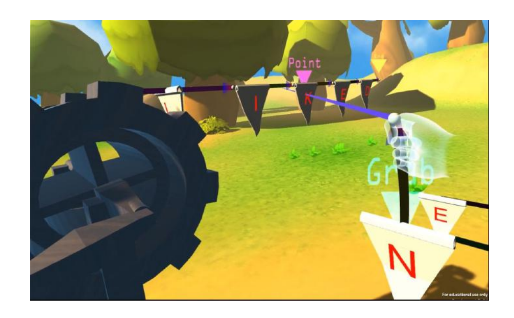
Part 0. Getting familiar with controls

0.3 Try to grab a flag as shown in step 0.2 . Keep holding the trigger under right middle finger, and raise your right pointer finger. If you do it correctly, there will be a purple ray extending from the right hand.