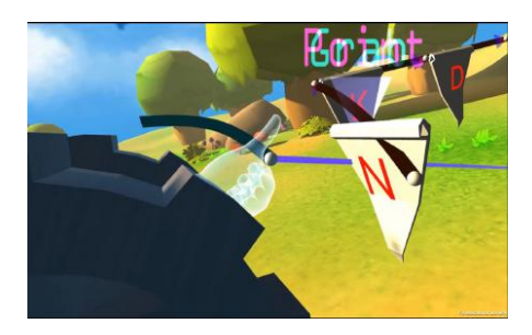
Part 1. Insertions