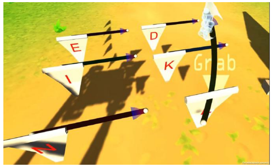
Part 0. Getting familiar with controls