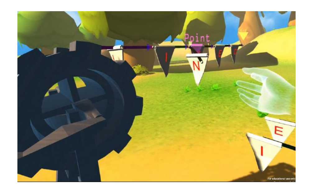
Part 0. Getting familiar with controls

0.5 Move your right hand and try to point the purple ray at a flag on the banner. When there is purple text saying "Point", release your hand. This will connect the flag you are holding to the next flag.