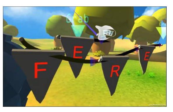
Part 2. Deletion