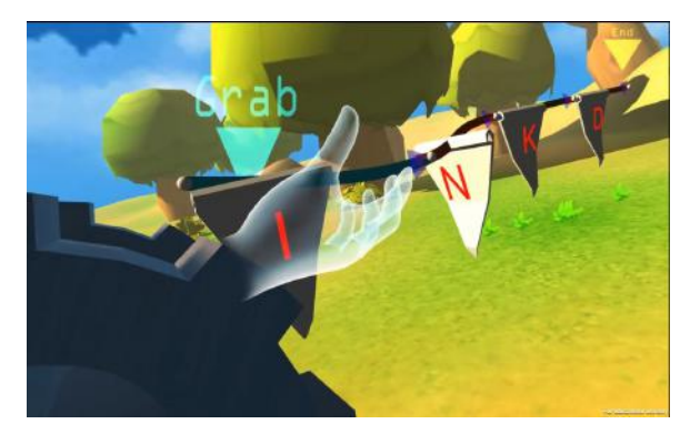
Part 0. Getting familiar with controls