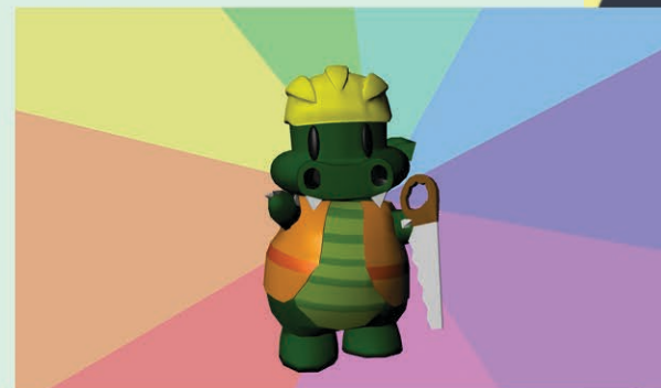
A shot from a render of Construction Croc's dance animation