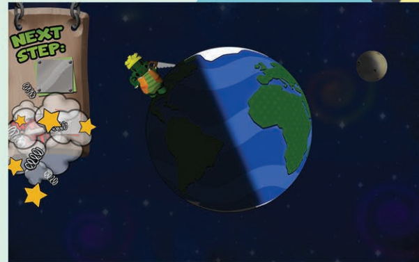
Construction Croc builds our UI in this Tutorial mock-up shot

This weekend we'll be working with a voice actor to record some audio for our characters. Next week we'll be wrapping up our tutorial and focusing our efforts on the sandbox mode we talked about at halves. We spoke with some of the faculty members on Friday about how best to design the sandbox to teach lessons about the day/night cycle and hope to have a demo of it to share soon.